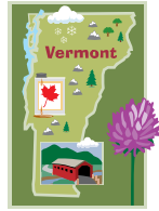
Vermont Fair Association