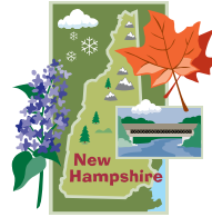
New Hampshire Fair Association